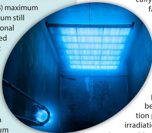
IMAGE: A cobalt-60 source rack in the storage pool of a gamma irradiation facility.

Dry ice is used to ensure that the cold chain is maintained throughout the irradiation process. The importance of temperature control for preservation of serum performance has been stressed previously in a separate article in this series [2] and will be discussed in more detail in a future paper. Dry ice can be added in specified quantities to specific compartments of the cryotainer, or it can be added in bulk to fill up the entire cryotainer. The former can be done when the cryotainer is specifically designed for that purpose, with the intent to minimize the influence from the presence of dry ice on dose delivered to the serum product. The latter is the most common process, where the cryotainer is also used for transport to and from the irradiation facility. In this case, dry ice is added to the cryotainer in preparation for transport to the irradiation facility, and